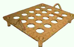
Quartz Tray 20 probes in parallel