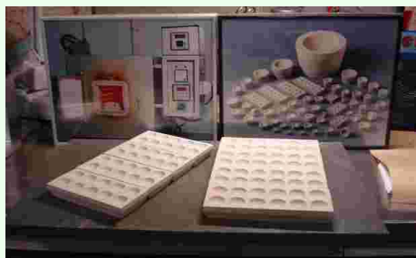
Cupellation: Cupel Blocks