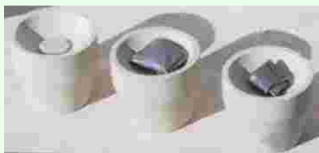
Cupellation: single cupels